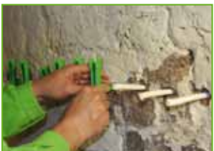
Installation of the KÖSTER Suction Angles