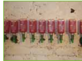
Automatic installation of the horizontal barrier