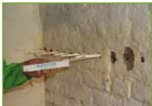
Installation of the KÖSTER Capillary Rods