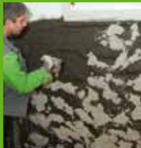
Application of the KÖSTER plaster key