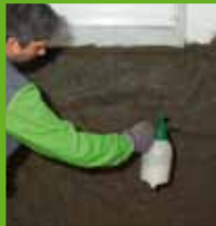
Priming with KÖSTER Polysil® TG 500

KÖSTER restoration plasters are especially designed for the restoration of masonry with high salt and moisture contents. They are also not affected by high salt contents and prevent salts from diffusing to the surface. When rising damp is stopped with KÖSTER Crisin® 76, KÖSTER restoration plasters help to dry out the wall and absorb remaining salts. KÖSTER restoration plasters withstand moist conditions since they do not contain lime or gypsum. They are open to water vapour diffusion and help to create a healthy and comfortable room climate.