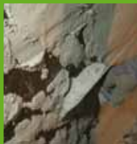
Application of KÖSTER restoration plaster