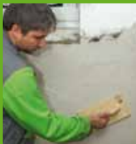
Smoothing the surface

Apply KÖSTER Polysil® TG 500 as a primer in order to strengthen the substrate and reduce the mobility of the salt molecules. KÖSTER restoration plasters are available in grey or white. In historic buildings they can be used as a decorative plaster even without painting. They are suitable for interior and exterior use.