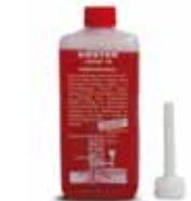
KÖSTER Crisin® 76