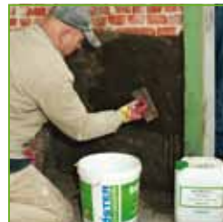
KÖSTER KD 3 Sealer