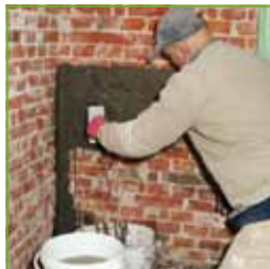
KÖSTER KD 1 Base