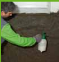
Priming with KÖSTER Polysil® TG 500

KÖSTER restoration plasters are especially designed for the restoration of masonry with high salt and moisture contents. They are also not effected by high salt contents and prevent salts from diffusing to the surface. When rising damp is stopped with KÖSTER Crisin® 76, KÖSTER restoration plasters help to dry out the wall and absorb remaining salts. KÖSTER restoration plasters withstand moist conditions since they do not contain lime or gypsum. They are open to water vapour diffusion and help to create a healthy and comfortable room climate.