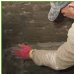
KÖSTER KD 2 Blitz