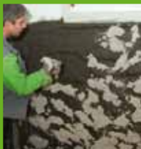
Application of the plaster key