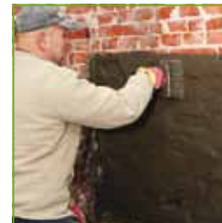
KÖSTER KD 1 Base

Mix as much KÖSTER KD 1 Base as can be applied within 10 minutes with water into a viscous, spreadable mass (slurry). Apply using a firm brush. Then immediately rub KÖSTER KD 2 Blitz powder into the fresh, moist slurry by hand until the surface is dry.