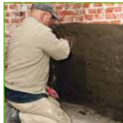
KÖSTER KD 1 Base