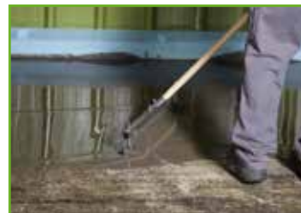
5. While working larger areas use a KÖSTER Gauging Rake to distribute the material