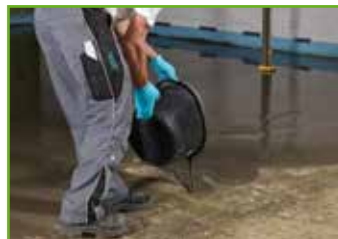
4. Distribute the material in the desired layer thickness directly after mixing