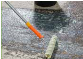
2. Prime with KÖSTER SL Primer