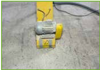
1. Substrate preparation