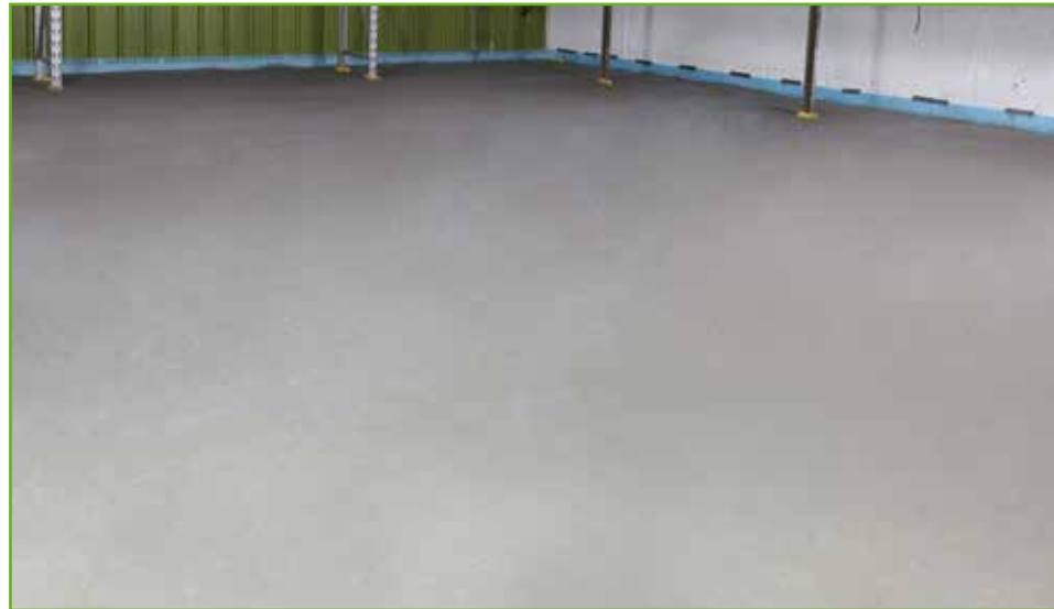
The result: a fast-setting underlayment that provides a smooth, level surface